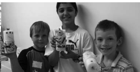
RIGHT: Summer family program participants show off the casts they created and decorated.